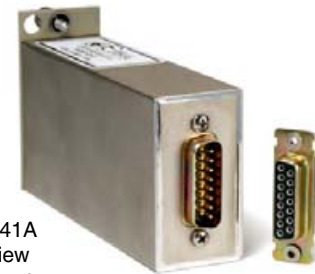
Model 441A Rear View with Connector

For price and delivery information, please contact the factory or the Ectron representative in your area.