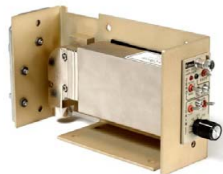
Model E408-1D Single-unit Mount, including DIN-rail adapter