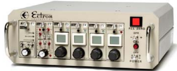
Model E408-6 Six-channel Portable Enclosure

The Models 441A and 441AL will operate in all standard Ectron enclosures designed for Models 352 and 428 Conditioner-Amplifiers and Model 451 LVDT Signal Conditioners. These include Models E408-1, E408-6, and R408-14 enclosures.