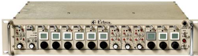
Model R408-14 Fourteen-channel Rack-mount Enclosure