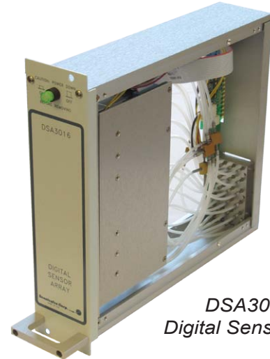
DSA3016/16Px Digital Sensor Array

The DSAENCL4000 uses a micro SD card to store all configuration and module data. The SD card is easily removed if needed for security reasons. The enclosure utilizes a pressure temperature look-up table to compensate the pressure sensors for temperature changes, effectively negating any thermal errors.