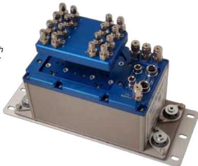
DSA5000 Gas shown with optional “QD” Px Header and Shock Mount Kit

All-Media or liquid builds are designed to handle a wide variety of compatible measurement media including water, oil, fuel, vapor, and more. All-media builds will have unique features including: