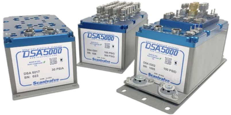
From Left to Right: DSA5000 - Standard Gas, DSA5200 - All-Media, DSA5300 - Gas / iDDS with "QD" Header and Shock-Mount