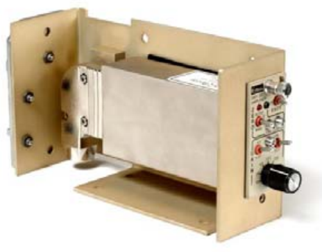
Model E408-1D Single-unit Mount, including DIN-rail adapter