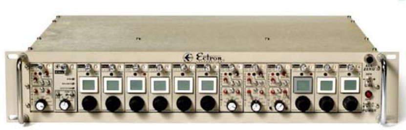
Model R408-14 Fourteen-channel Rack-mount Enclosure

The Models 441A and 441AL will operate in all standard Ectron enclosures designed for Models 352 and 428 Conditioner-Amplifiers and Model 451 LVDT Signal Conditioners. These include Models E408-1, E408-6, and R408-14 enclosures.