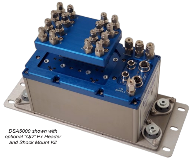
DSA5000 shown with optional “QD” Px Header and Shock Mount Kit

Standard DSA5000 modules come with the reference side of all 16 transducers manifolded to a single reference port. If the DSA is ordered as a dual-range unit, a reference port is provide for each range. As an option, the DSA can be configured with individual reference ports for all 16 channels. When true differential measurements are required, an 8 channel “True Differential” configuration provides inputs and calibration valves on both sides of each individual transducer. Absolute configurations are also available.