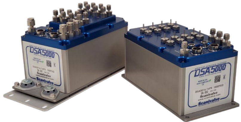
DSA5000 - Standard (right) DSA5000 - “QD” w/shock (left)