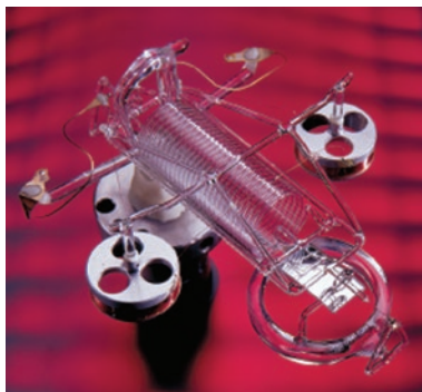
The Series 7250 features a unique fused-quartz sensor. This rugged transducer offers unequalled precision and a stability of 0.0075% of reading per year.

Wide pressure range: available with any full scale pressure between 5 and 2 500 psi (35 kPa and 17.2 MPa) or for higher pressures select the 3 000 psi absolute (21 MPa) range.