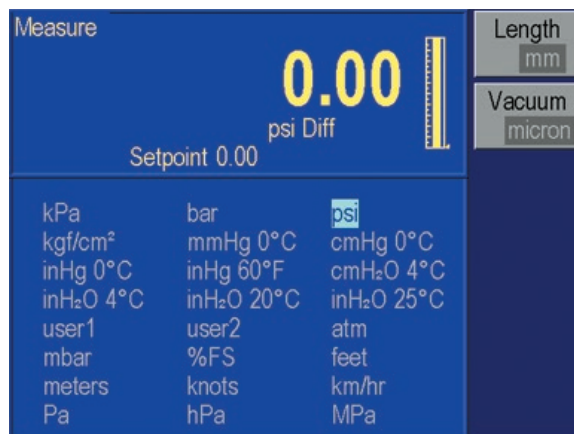
The large color display allows the pressure value to be displayed even when viewing a submenu selection such as the units selection screen shown above.

The Series 7250 Pressure Controller/Calibrator can easily automate your test and calibration workload. All are easy to use, easy to maintain, and have the reliability, performance and features that you want. The Series 7250 features an easy-to-navigate menu structure with full text descriptions for menus and commands.